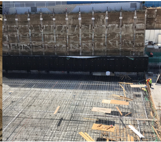
E.Protect+ extending up from under the slab and up the vertical wall past the design water table