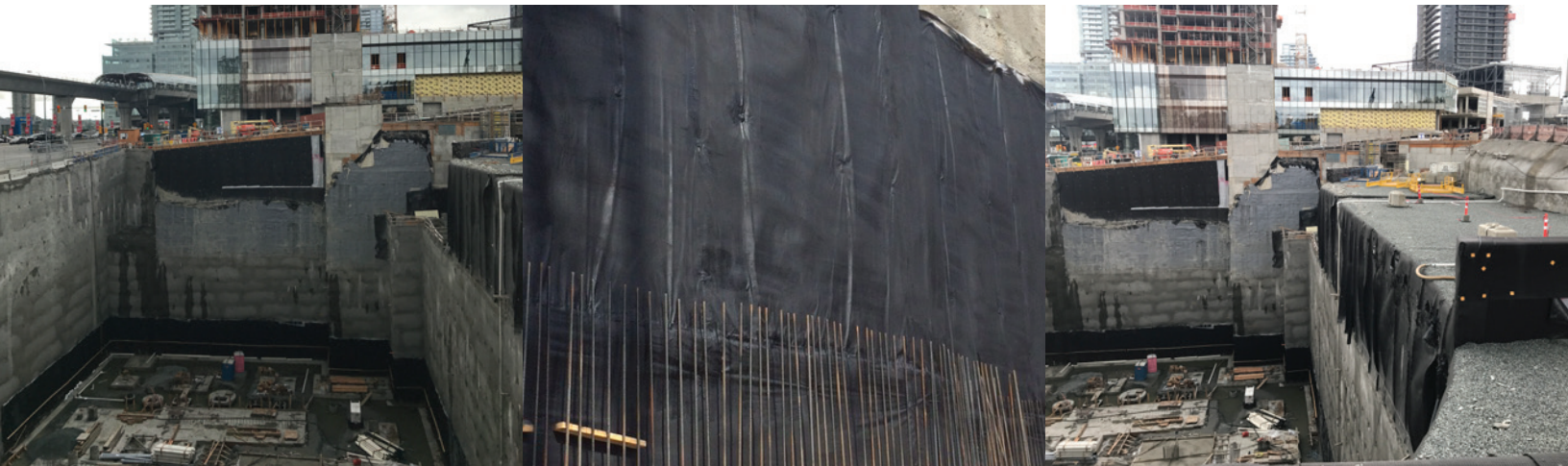
Looking over Tower 3 excavation. Here, the first lift of EPRO is being installed