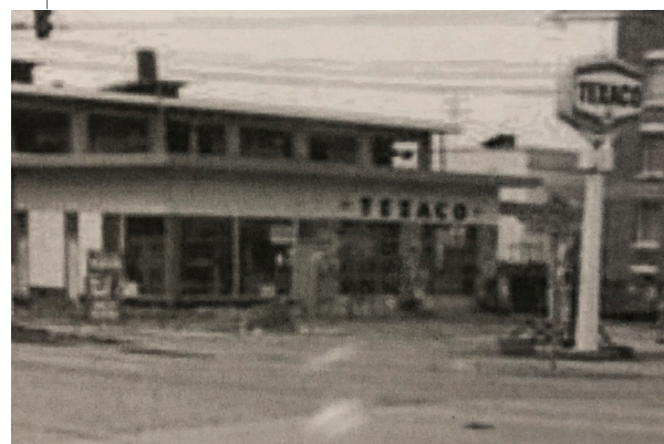
Original Texaco station that operated on site for 70 years from 1923 - 1993.

EPRO PreTak is an entire below grade building envelope solution that has provided an effective waterproofing and contaminant vapor barrier membrane necessary to rewrite the legacy of this Seattle corner gas station to serve the community for many years to come, safely, effectively and economically.