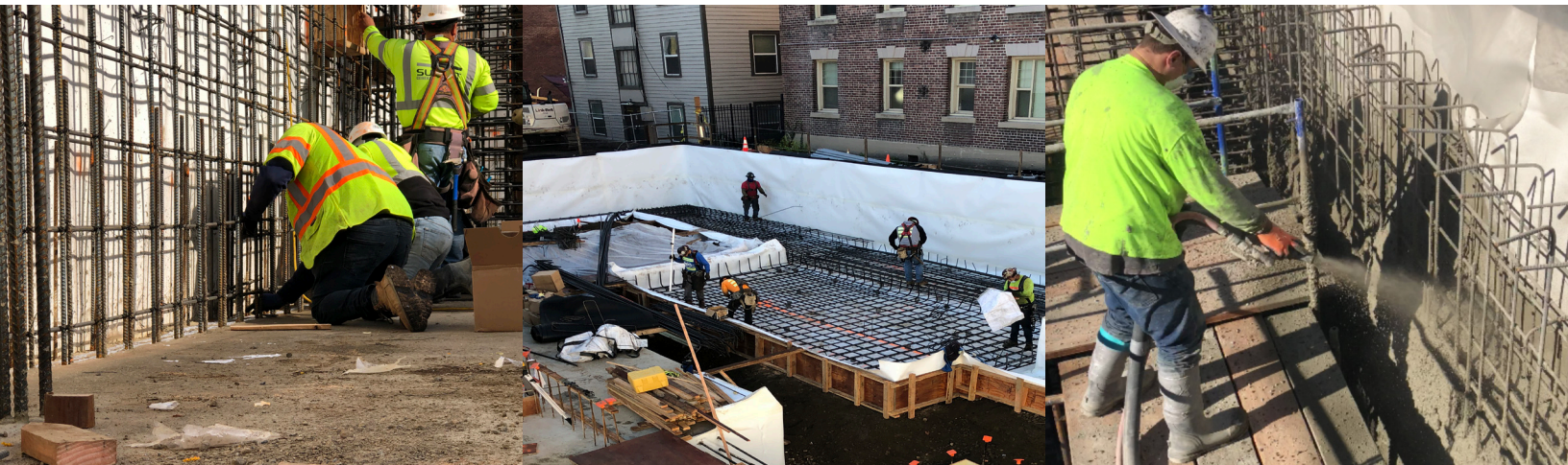
Installation of rebar against vertical blindside application of the PreTak membrane.