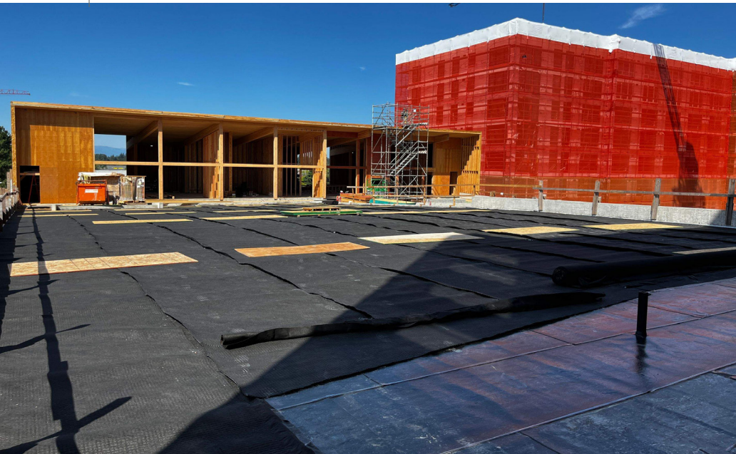
Before and after images of the site.